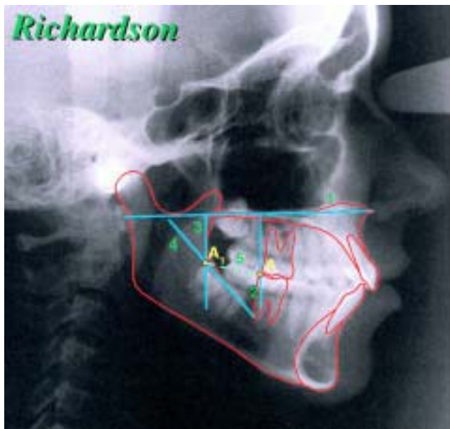
Fig. 3- Evaluation of dentition posterior according to Richardson